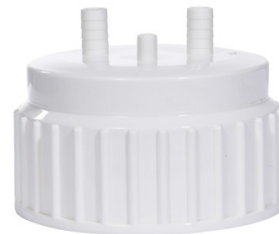
Filling / Venting Closure