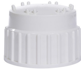
Size 83B Closure